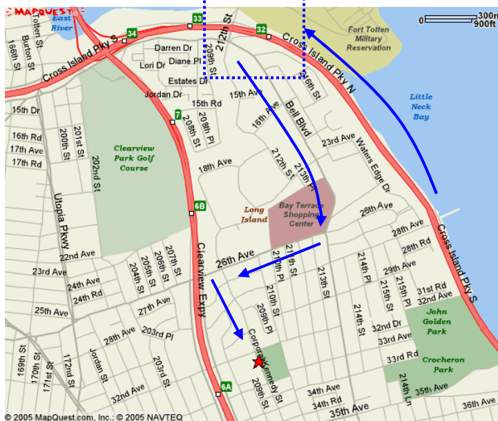
Detail of Exit 32 From CI Pkwy