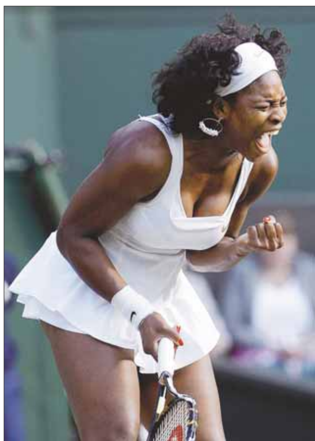
Serena Williams celebrates her victory over unranked Zheng Jie in the Wimbledon semifinals. Serena will face sister Venus in an all-Williams final Saturday.