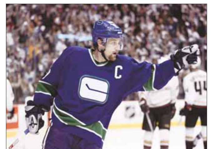
The Rangers signed former Vancouver star Markus Naslund Thursday, ending its relationship with free agent Jaromir Jagr. The Rangers also signed defenseman Dmitri Kalinin during what is turning into a busy off-season.