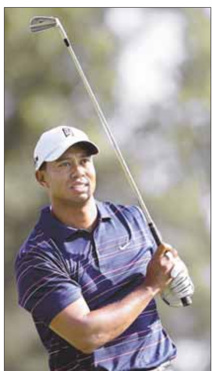
Tiger Woods watches his second shot to the 11th hole during the second round of the Bridgestone Invitational golf tournament Friday at Firestone Country Club in Akron, Ohio.

after any round at Firestone he has been out of the top 10. He was 2 under, the same score he had in 2007 when he went on to win by eight.