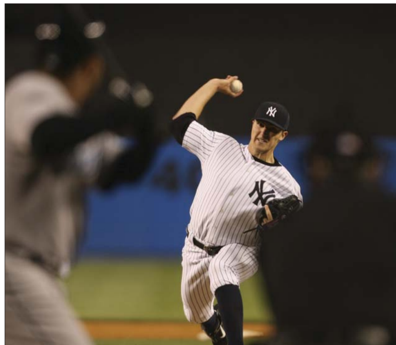
New York Yankees rookie Phil Hughes delivers a pitch during the third inning of his major league debut Thursday night against the Toronto Blue Jays. Hughes work into the fifth inning and was saddled with the loss. Toronto scored a 6-0 victory.