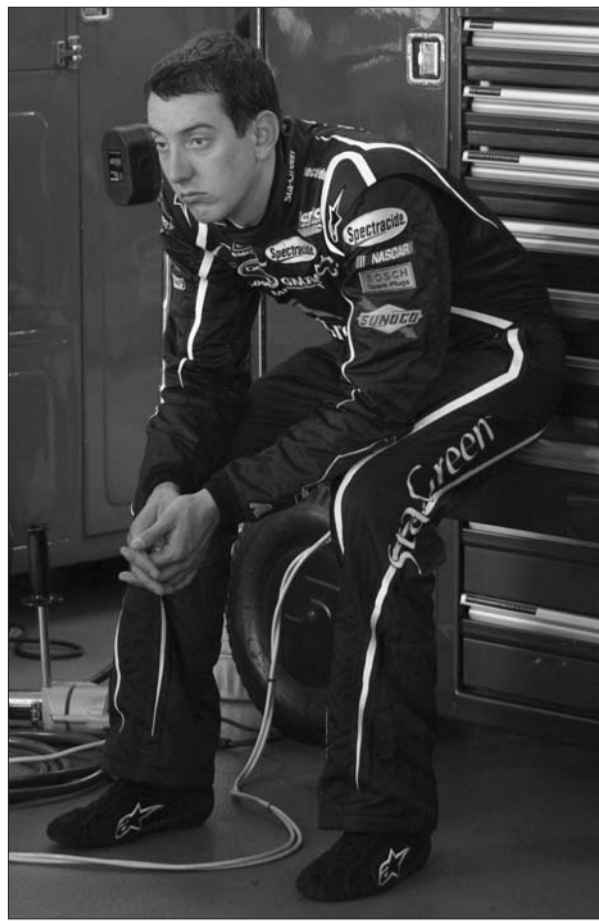
Brothers Kurt Busch, climbing into his car in photo at left, and Kyle Busch, sitting in the garage area at Charlotte in the photo at right, got into a wreck during Saturday night's NASCAR Nextel Cup All-Star race. The two have talked out their differences and hope to put the bad blood behind them.