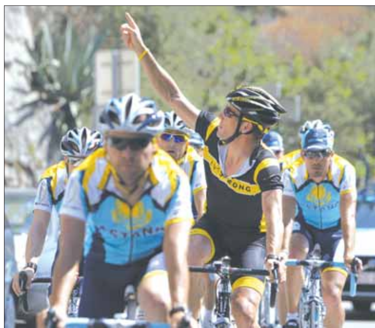
Seven-time Tour de France winner Lance Armstrong, center, gestures as he rides with his Astana teammates during a training session this week in Monaco. The 96th edition of the Tour de France begins today with Armstrong back in the field after a three-year absence.