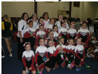
Jr. Pee Wee

A BIG thank you goes out to ALL the volunteers who helped make the Cheer For Fun Comp a huge success.